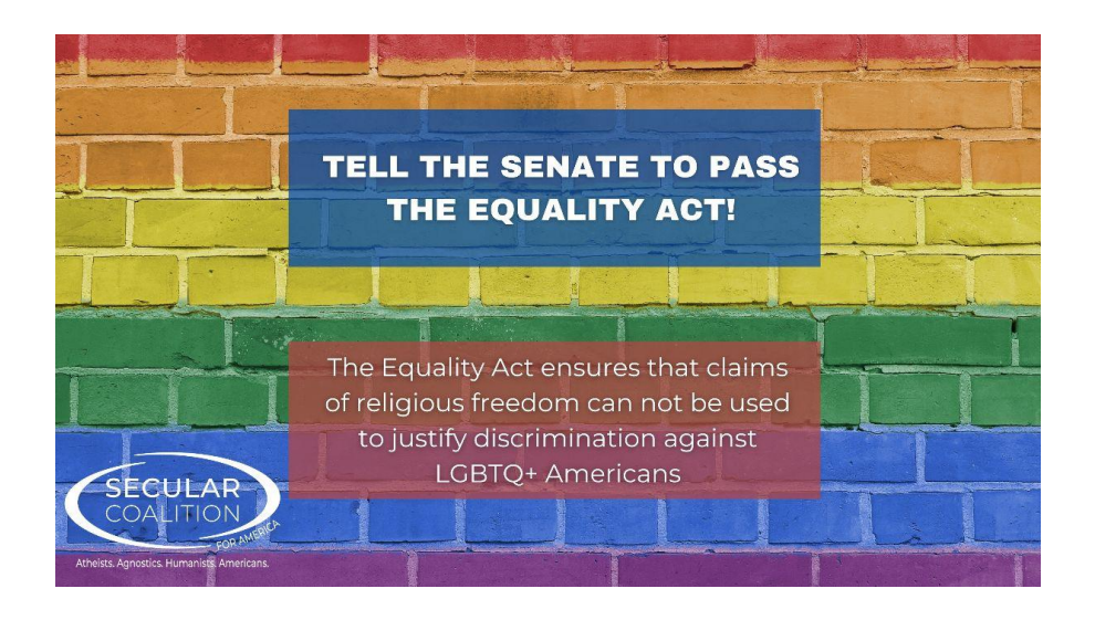
Tell the Senate to Support the Equality Act - Secular Coalition for America

It is important that we dispel these <u>untrue myths</u> about this legislation, which seeks only to provide the same protections that most of us already are afforded to those who are not. We must always push back against these false narratives whenever they are presented. Only by doing so will we be able to do away with the myths and focus on the <u>facts of the issue</u>, which is equal treatment under the law for everyone, regardless of race, religion, gender, sexual identity, or sexual orientation.